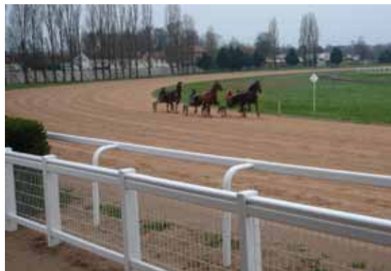
Duralock North America / 5

The race rail is available in oval and round configurations as well as a double midcourse rail. Slip rails are incorporated into designs to create gaps in the rail to allow for easy track access.