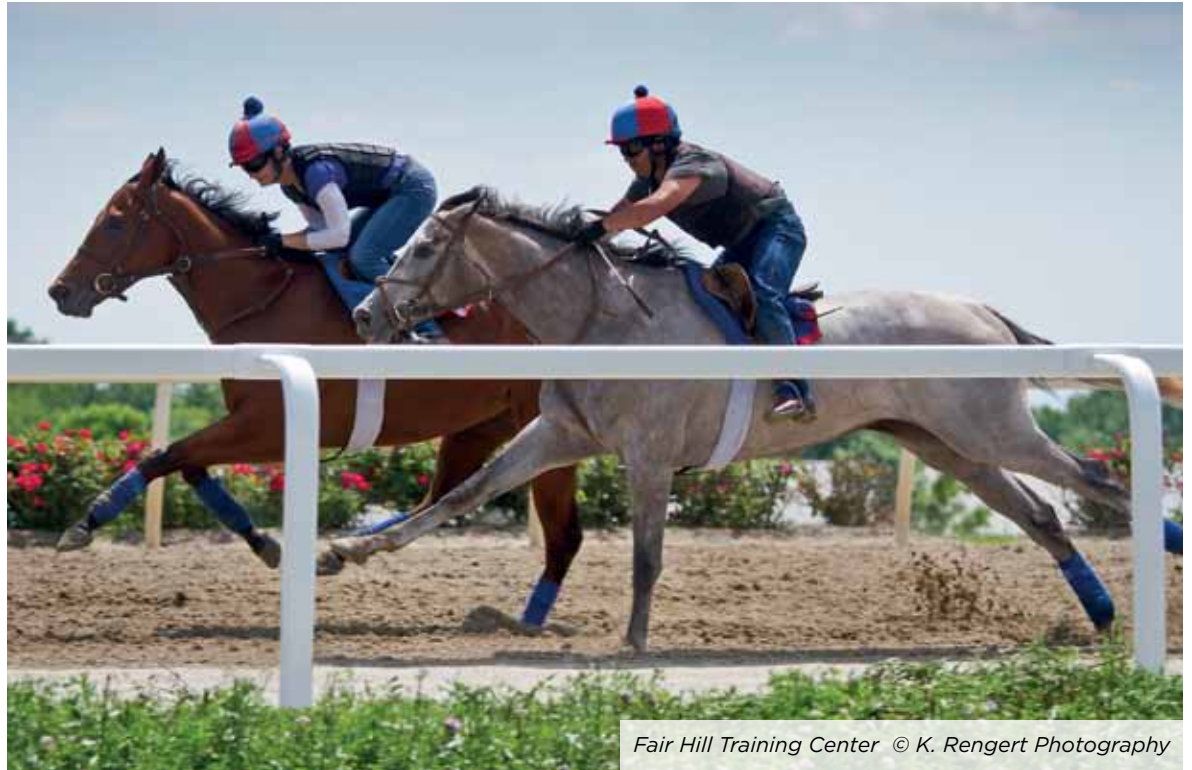
Fair Hill Training Center

The rail may be installed permanently or used as a moveable system that can be swiftly reconfigured. The moveable feature is extremely useful when repositioning the turf rail and tracks have installed our permanent footings that make it simple to adjust the racing path.