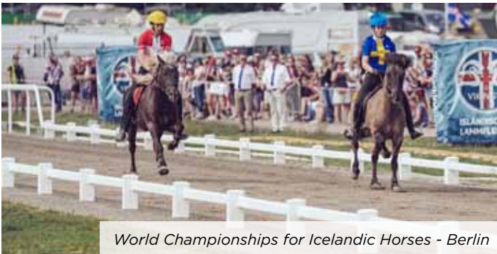
World Championships for Icelandic Horses - Berlin