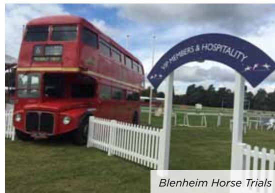
Blenheim Horse Trials

Moveable crowd barriers enable the facility to reconfigure for special events and crowd control.