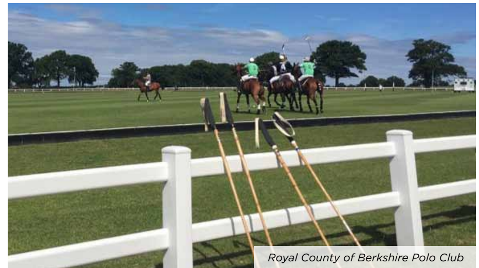
Royal County of Berkshire Polo Club