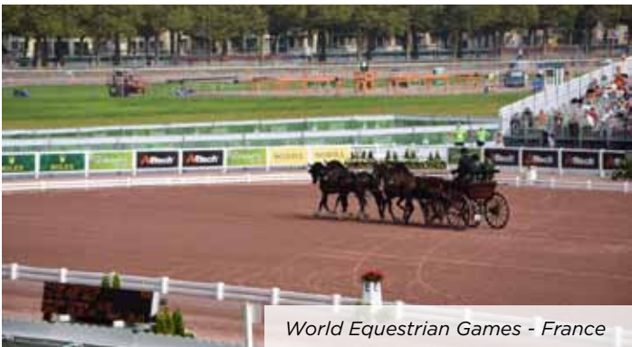
World Equestrian Games - France