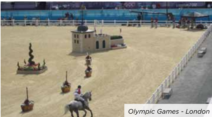
Olympic Games - London