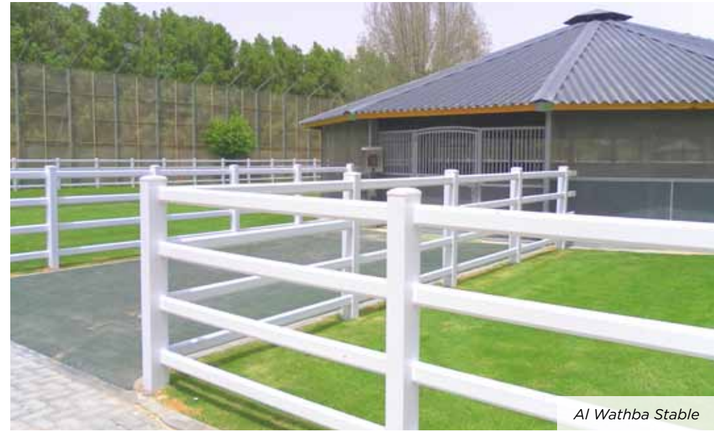
Al Wathba Stable

Duralock post and rail fencing has been utilized at prestigious equestrian events, including Olympic Games, Asian Games and Kentucky Three Day Event.