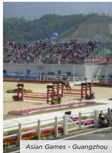
Asian Games - Guangzhou

Duralock post and rail fencing has been utilized at prestigious equestrian events, including Olympic Games, Asian Games and Kentucky Three Day Event.