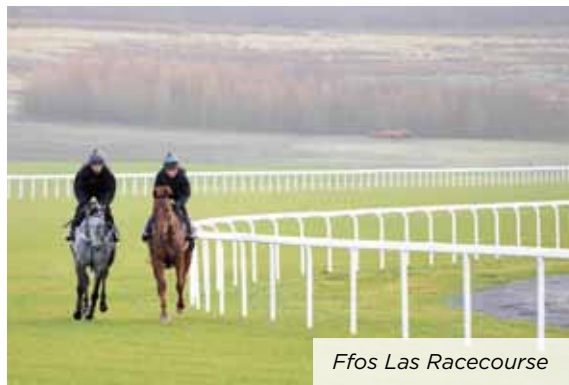
Ffos Las Racecourse