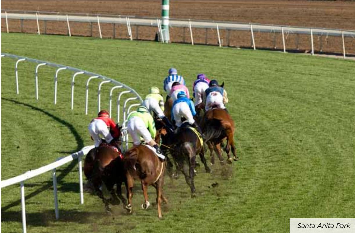
Santa Anita Park

The race rail is available in oval and round configurations as well as a double midcourse rail. Slip rails are incorporated into designs to create gaps in the rail to allow for easy track access.