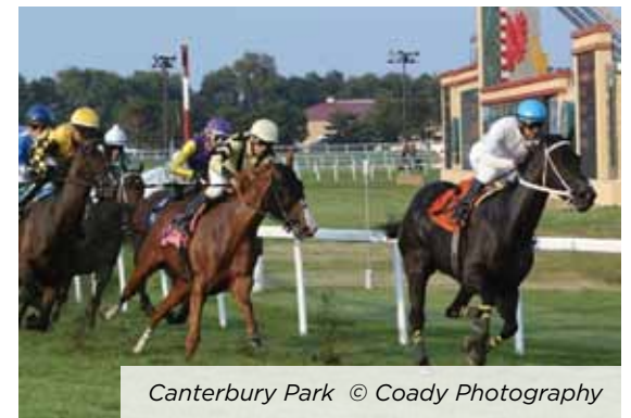
Canterbury Park