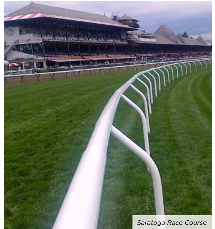
Saratoga Race Course