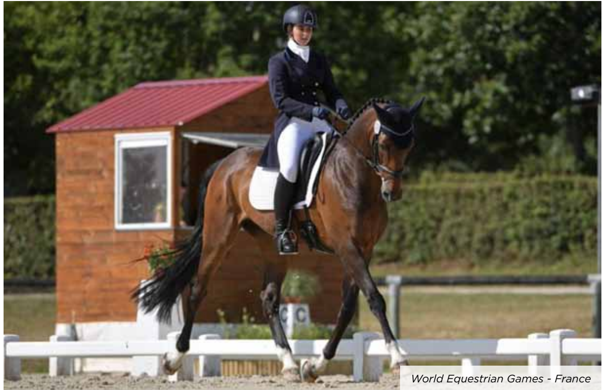
World Equestrian Games - France

Our single or dual dressage fencing is designed to fit FEI specifications. We provide your choice of concrete or pins to be placed on every other post for stability. Duralock fencing has been used in arenas hosting international dressage competitions.