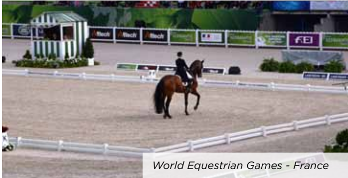
World Equestrian Games - France